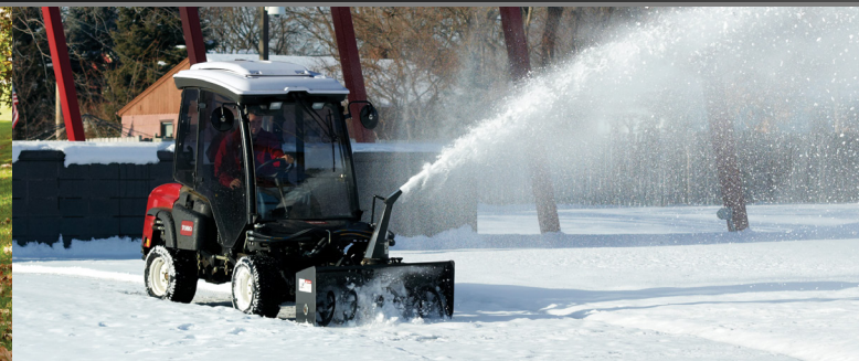
Front QAS Winter Attachments – 4WD Models Only