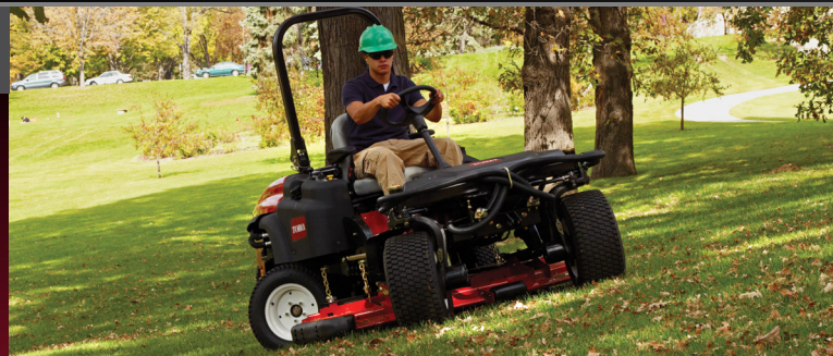
Mowing Deck Options